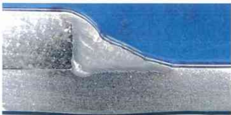
Weld Procedure Qualification